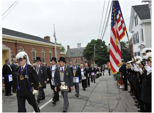
St. John's Sunday Procession

9:00am - 1st District Masters Class & NH Masonic Education @Gideon Lodge. See more detailed information within the Master's Messages from the East .