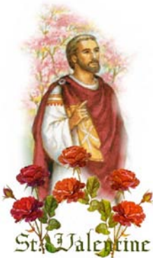
St. Valentine's Day