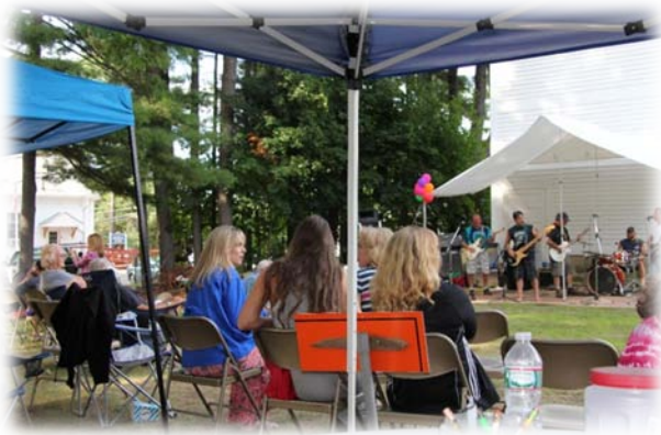
Many turned out for fun and music!